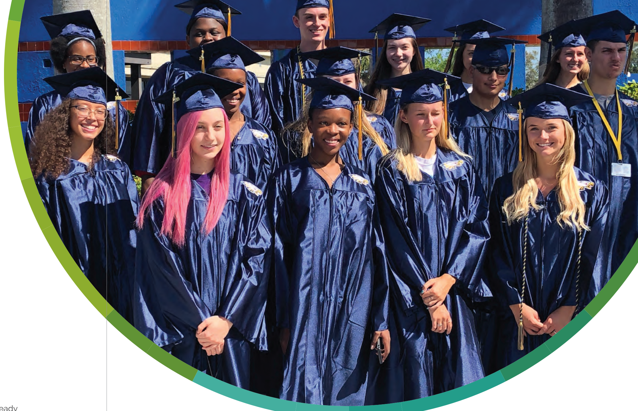
RIGHT: GRADUATING SENIORS AT NAPLES HIGH SCHOOL CELEBRATE THEIR BIG DAY.