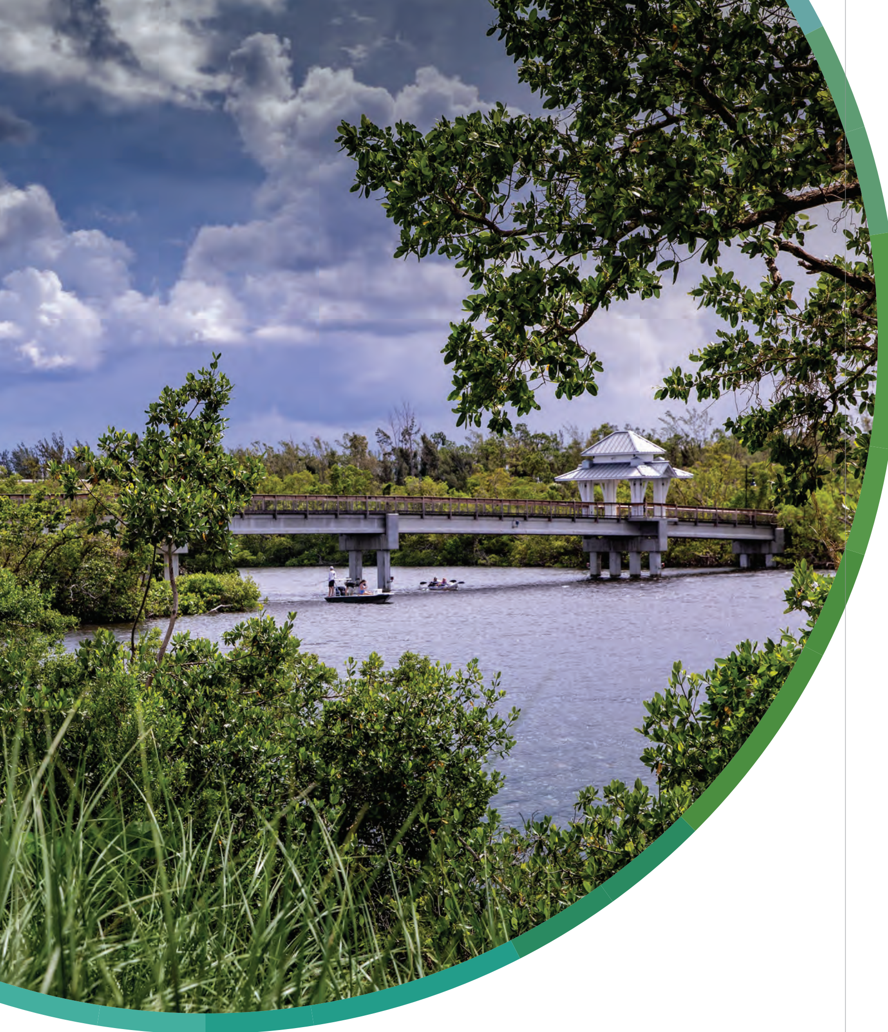
ABOVE: COLLIER COUNTY RESIDENTS AND VISITORS RELY ON CLEAN WATER FOR FISHING AND WATER SPORTS AT THE BLAIR FOUNDATION BRIDGE IN BAKER PARK.